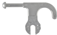
HOK-HS166 Disconnect hook (Optional)