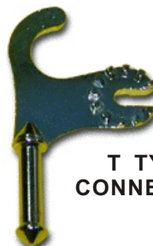
T TYPE CONNECTOR