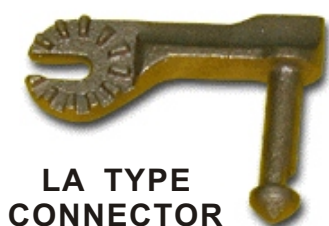
LA TYPE CONNECTOR